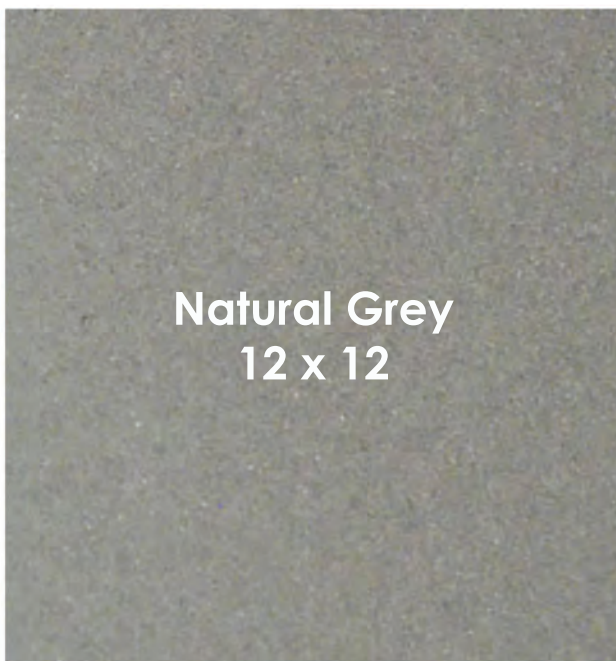
Natural Grey 12 x 12