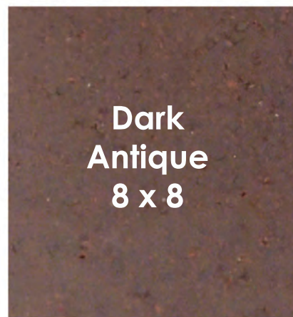
Dark Antique 8 x 8